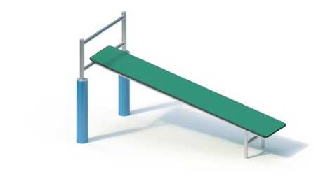
(exemplary colour illustration)