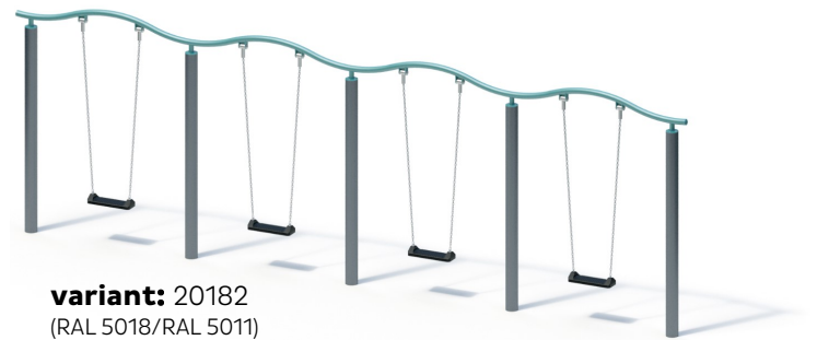
variant: 20182 (RAL 5018/RAL 5011)